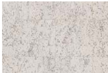
Fiord Exclusive RY19002 - 600 x 300 x 3,0mm Finishing: Wax