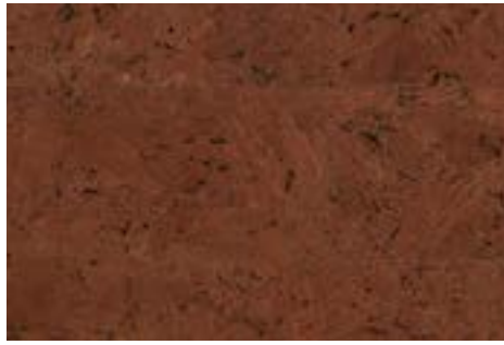
Piel Nut RY11001 - 600 x 300 x 3,0mm Finishing: Wax