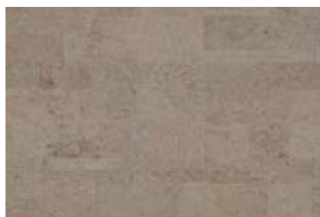
Malta Platinum RY1K001 - 600 x 300 x 3,0mm Finishing: Wax