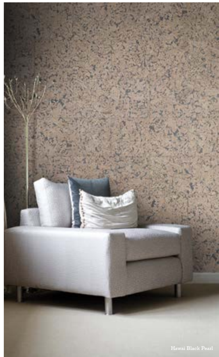
Hawai Black Pearl