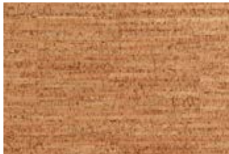
Bali RY48001 - 600 x 300 x 3,0mm Finishing: Wax