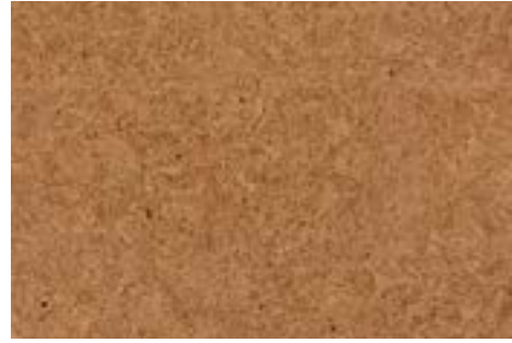
Cayman RY56001 - 600 x 300 x 3,0mm Finishing: Wax

The blended design of Cayman was created to infuse a warm touch of natural serenity into interior decors. The small organic forms of cork, appeal to our senses and capture the cosy essence of nature.