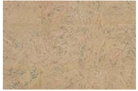
Piel Aqua RY11001 - 600 x 300 x 3,0mm Finishing: Wax