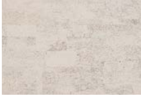
Malta Moonlight RY1N001 - 600 x 300 x 3,0mm Finishing: Wax