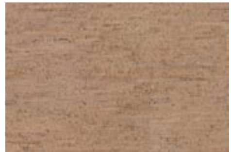
Bamboo Toscana TA05001 - 600 x 300 x 3,0mm Finishing: Varnish