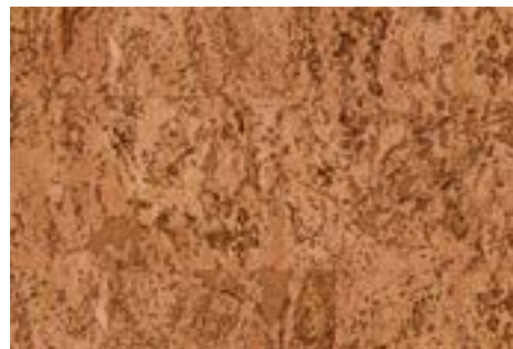
Fiord Natural RY15001 - 600 x 300 x 3,0mm Finishing: Wax