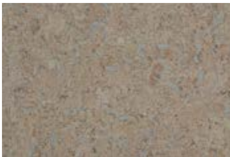
Hawai Black Platinum RY1H001 - 600 x 300 x 3,0mm Finishing: Wax