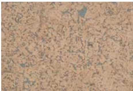
Hawai Black Oyster RY1G001 - 600 x 300 x 3,0mm Finishing: Wax