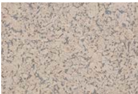
Hawai Black Pearl RY1F001 - 600 x 300 x 3,0mm Finishing: Wax