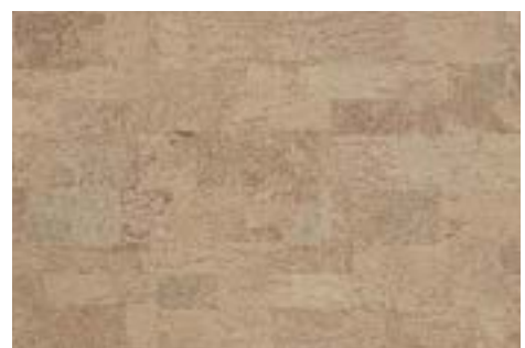
Malta Champagne RY1M001 - 600 x 300 x 3,0mm Finishing: Wax