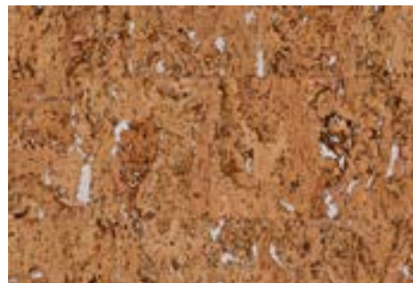
Fiord White RY19001 - 600 x 300 x 3,0mm Finishing: Wax