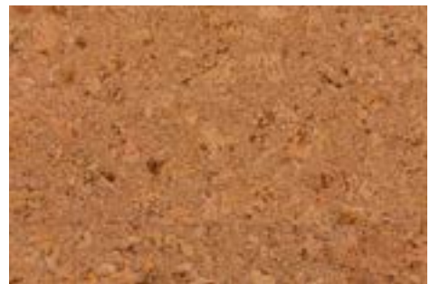
Melville RY40001 - 600 x 300 x 3,0mm Finishing: Wax

Based on a refined cork visual, Melville is the ideal choice if you are aiming for timeless beauty. Rustic designs are trending in modern interior decoration, and Melville results in an inviting and captivating atmosphere.