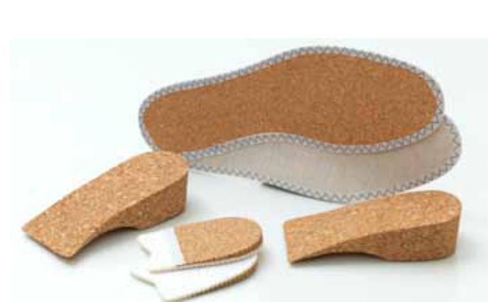
Insoles & Heels