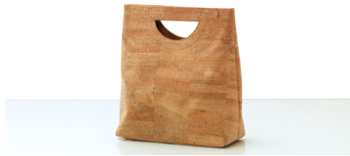
Lady's Handbag 8872