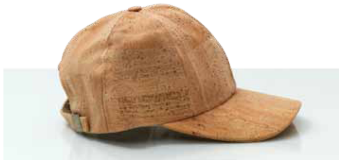
Baseball Cap 8830