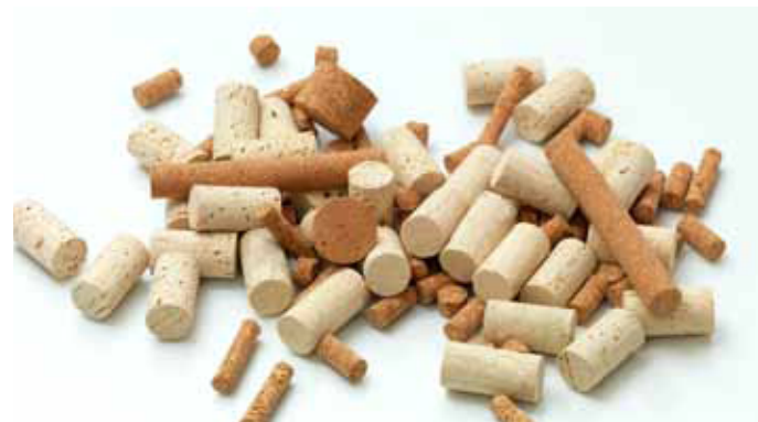
Cork - Do It Yourself Ek 12 893