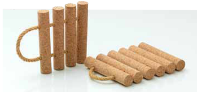
Trivet Raft 1275