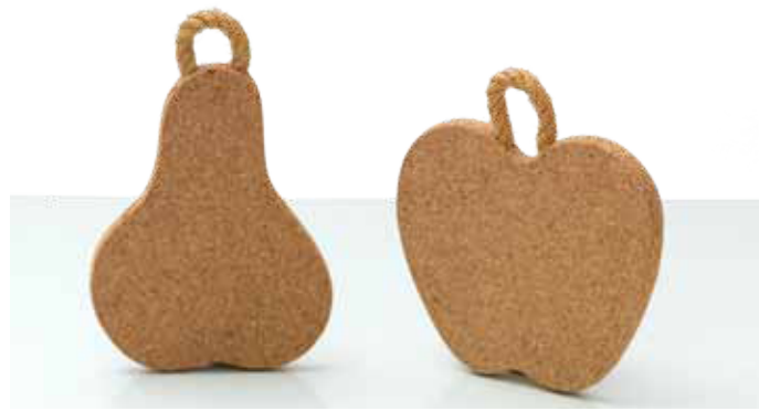
Rope Fruit Trivets 1213P