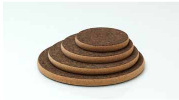
Hot Pads 1201-HD-20, 1202-HD-20, 1203-HD-2, 1204-HD-20