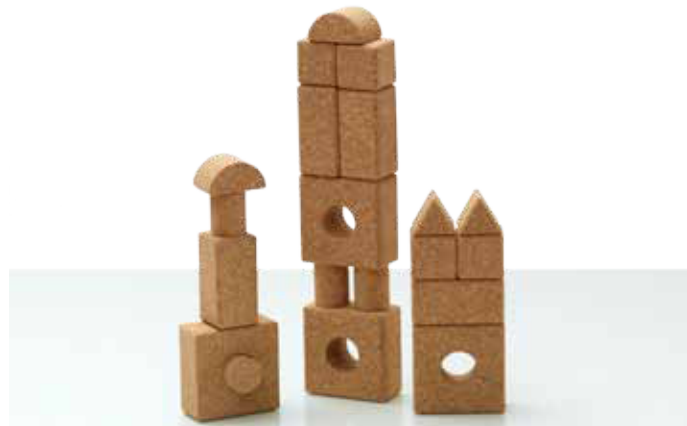
CREATE - Cork Toy 3450-T