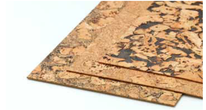
Decorative Sheets 3408