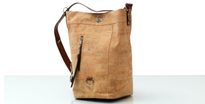
Lady's Bag - Horse 8902