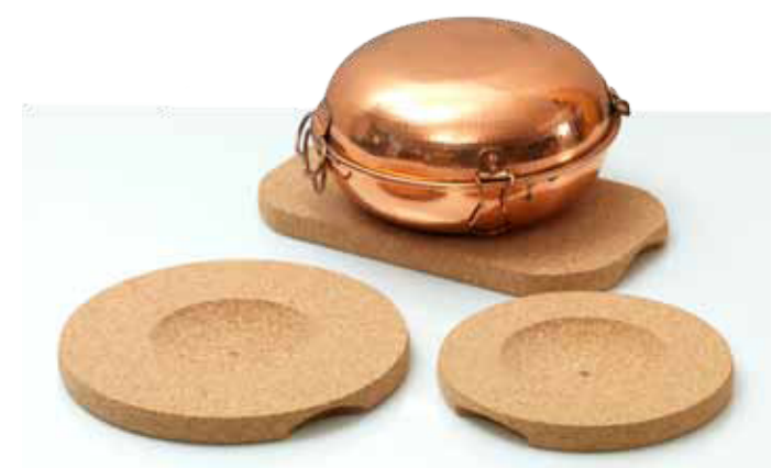
Trivet for Cataplana 1254 1255 1213 -C 1214-C