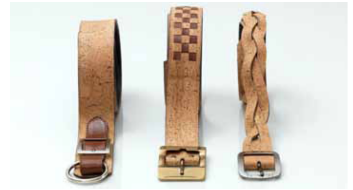
Lady's Belt 8934