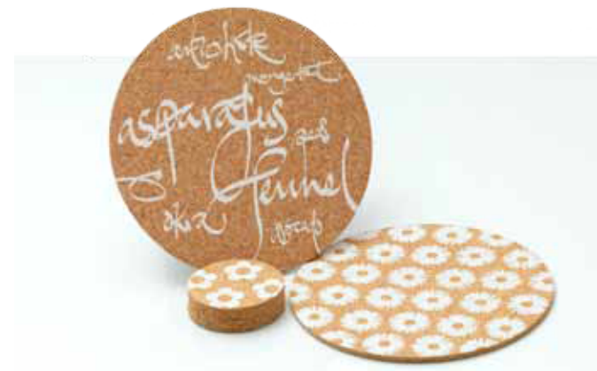
Table Mats & Coasters printed