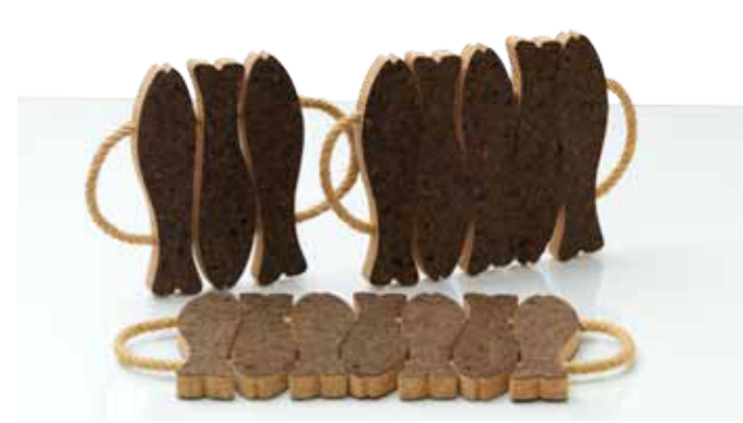
Trivets 1228-HD 1228-3-HD 1228-7-HD