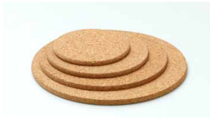
Hot Pads 1201 1202 1203 1204