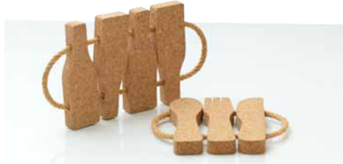
Rope Bottle Trivet 1228G