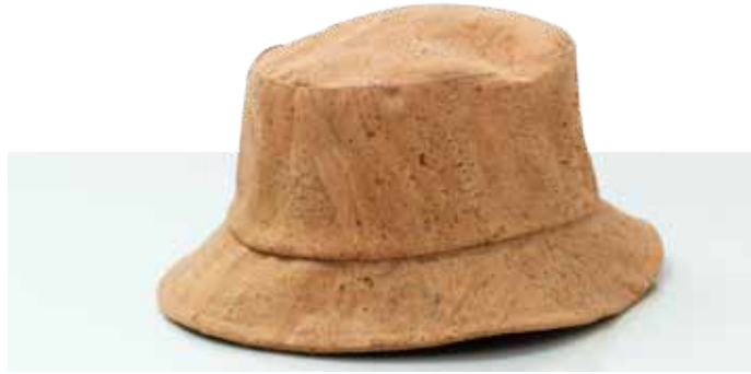
Panama Hat 8847