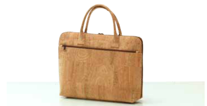
Lady's Briefcase - Zipper 8909