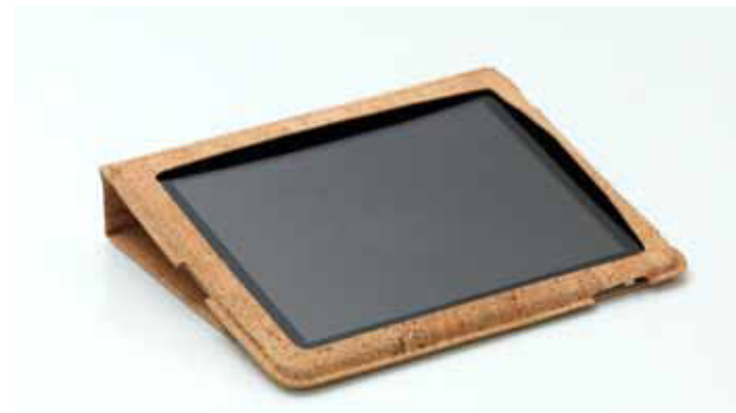
iPad Cover 8921