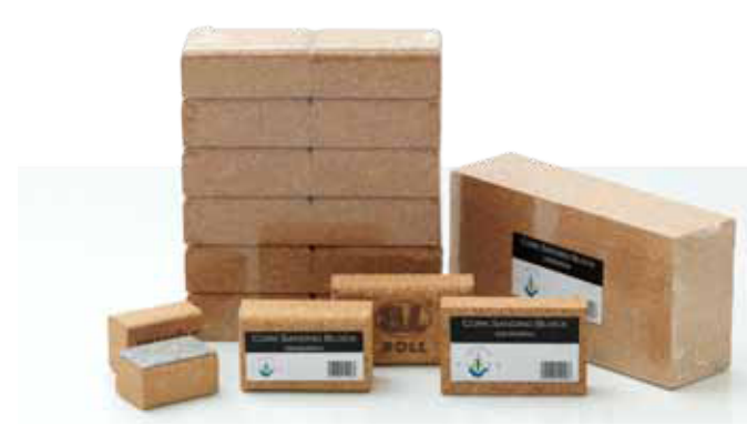
Sanding & Waxing Blocks