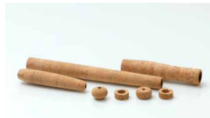
Handles & Cork Discs