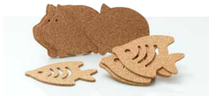
Hot Pads 1202-5