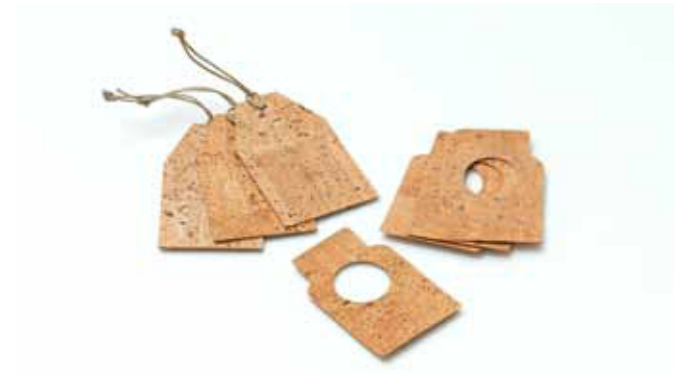
Wine Bottle Tags SKU 5492665