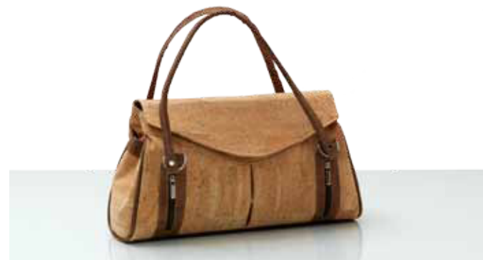
Lady's Bag 11 8923