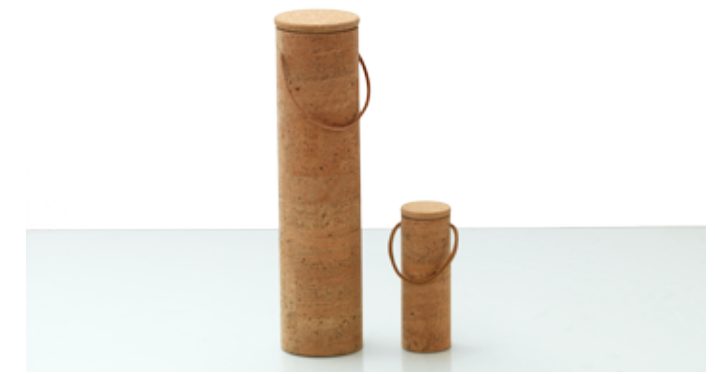
Wine Bottle Tube 9911