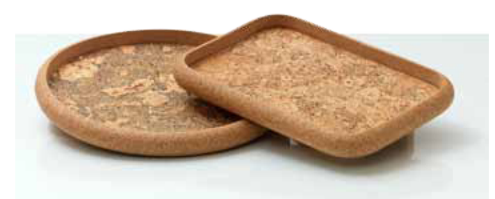
Trays Tray 21 Tray 73