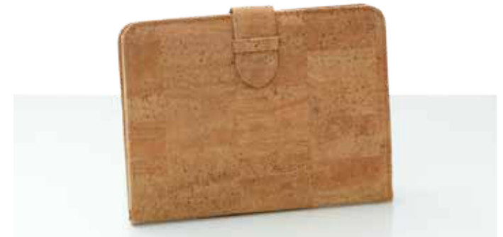
Portfolio A4: 8803 A5: 8871 A6: 8899