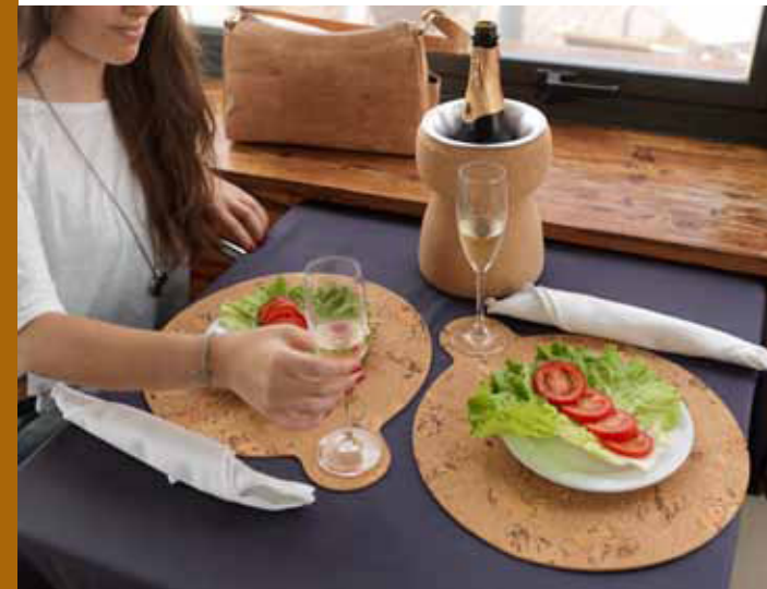
Table Mats 1210