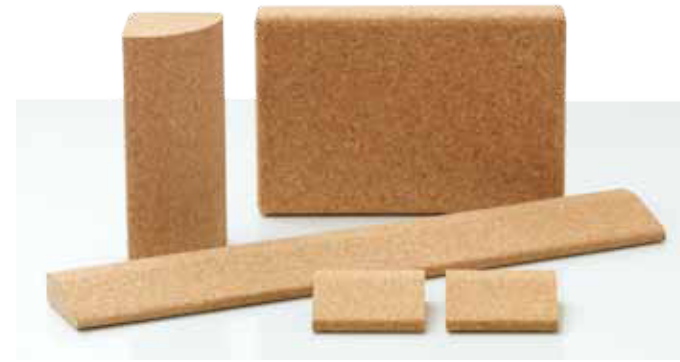
Yoga Accessories Yoga 5 Yoga 6 Yoga 9 Yoga 10

The Cork Yoga Block sets the standard for high performance yoga props. Cork has a firmness not found in foam blocks, and it allows you to feel secure in the support it provides. One can also feel good about the material. Cork is a completely ECO friendly item, harvested from highly-sustainable and renewable sources in Portugal.