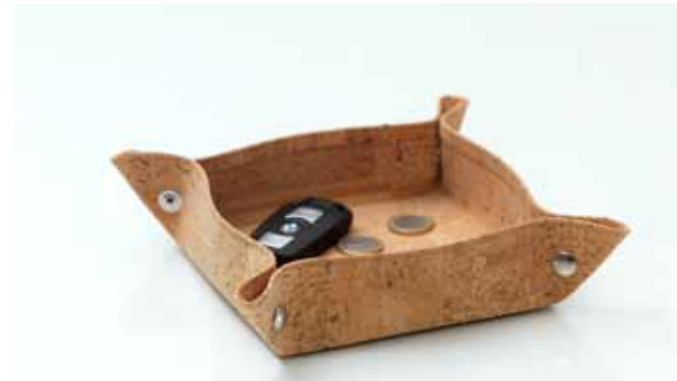
Empty Pockets 8908