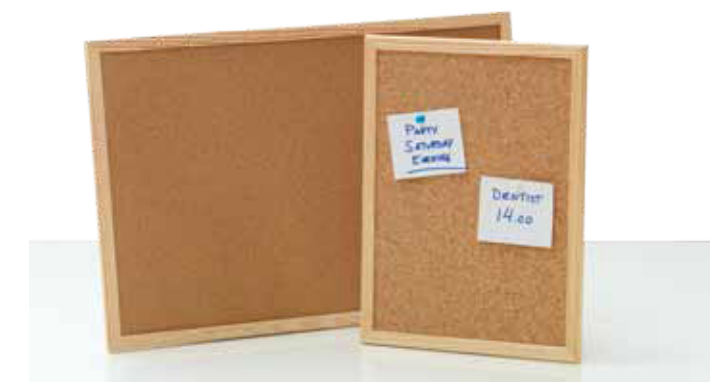
Cork Memo Board 1215 1216 1217