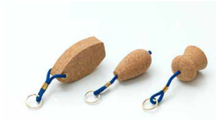
Keychain 1254-k 1242 9917