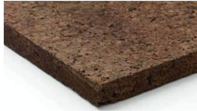
Insulation Cork Board 3420