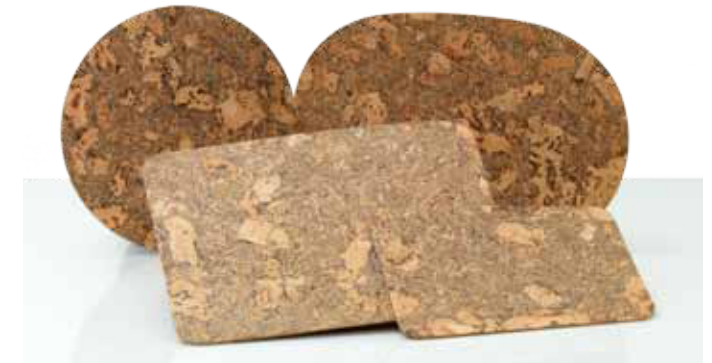
Table Mats 1210-N 1210-N-300