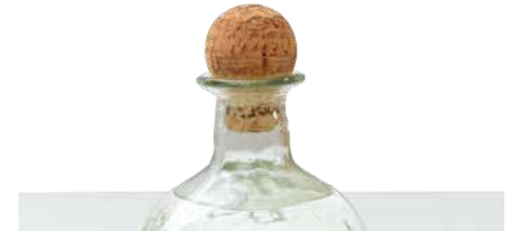
Cork Sphere Top