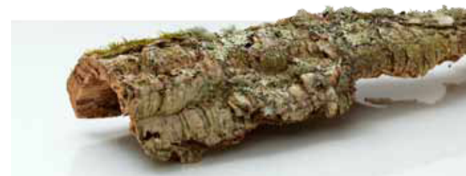
Virgin Cork Flat 12707