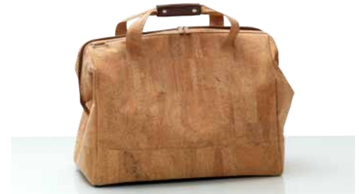
Trip Bag Large: 8917 Small: 8916