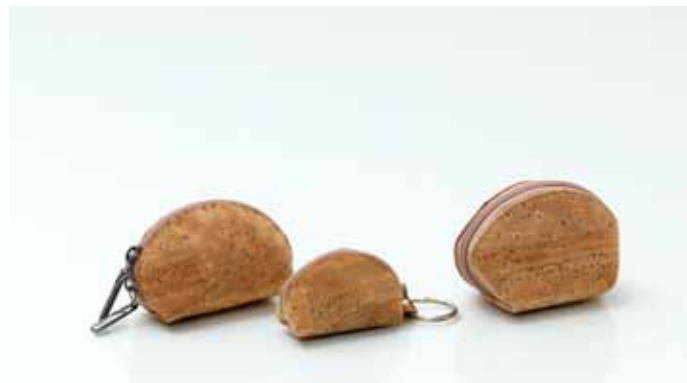
Round Cosmetic Mini - Round Cosmetic 8843 1412