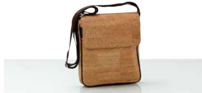
Unisex Bag 8891