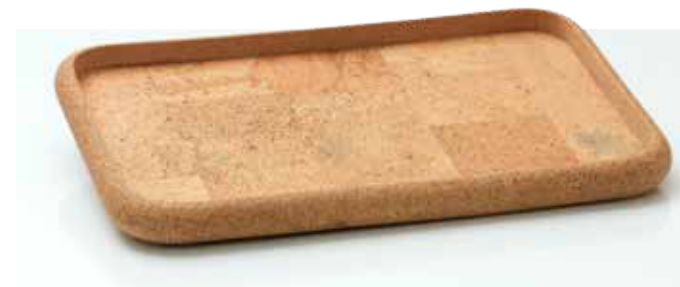
Tray Tray 16