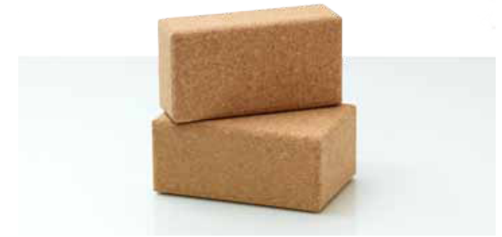
Yoga Blocks Yoga 2 Yoga 8