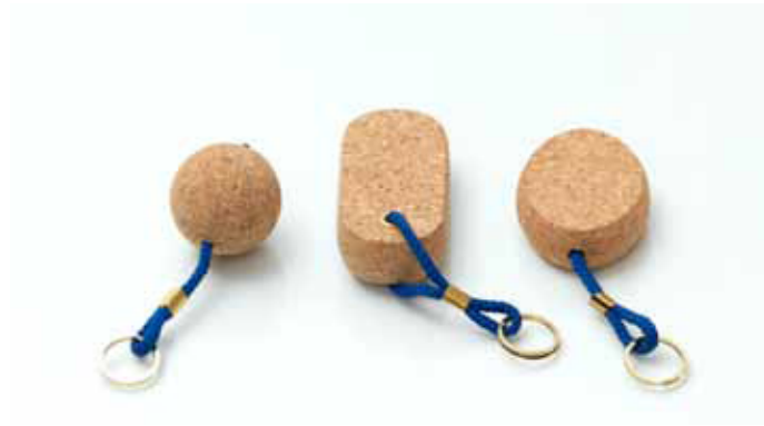
Keychain 1241 1246 1243