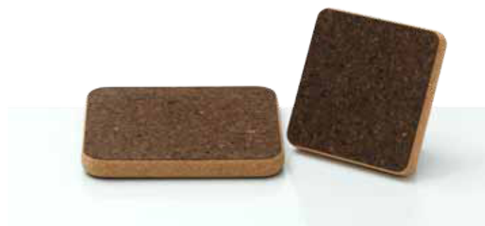
Hot Pads 1201-HD-20 1202-HD-20