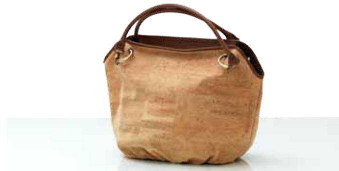
Lady's Bag - Hobo 8839