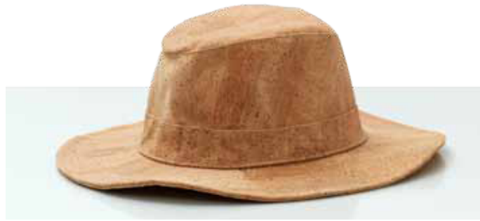
Cowboy Hat 8849