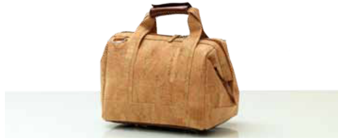
Lady's Weekend 8915