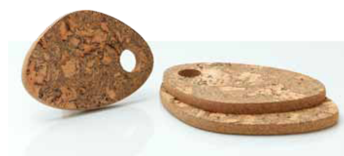
Hot Pad Pebble 1276