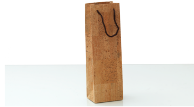
Wine Bottle Bag 9910

Cork gifts, each item have their own natural and beautiful presentation,... ideal for wine lovers.