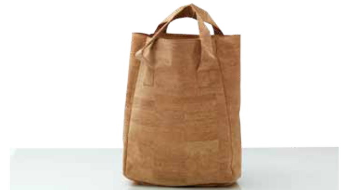
Shopping Bag 8914