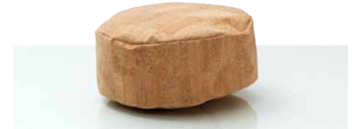
Yoga Cushion 8912