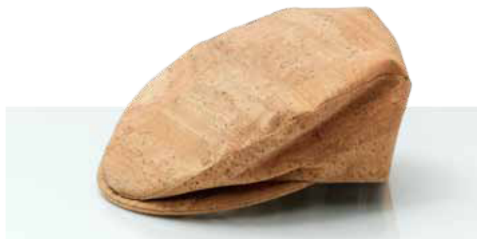
Catalan Hat 8910