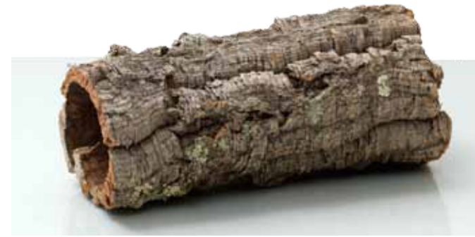
Virgin Cork Tubes 12708

The natural rough cork sheets are fantastic for background walls in any terrarium and vivarium.