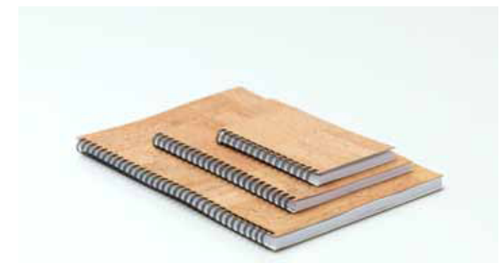
Note Pads A4 - 9922