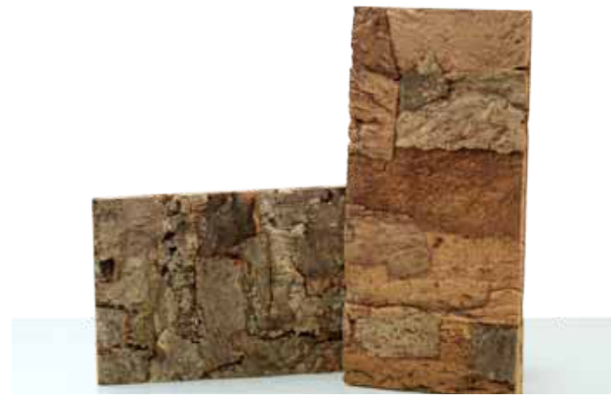
Virgin Background Ek 12 B709