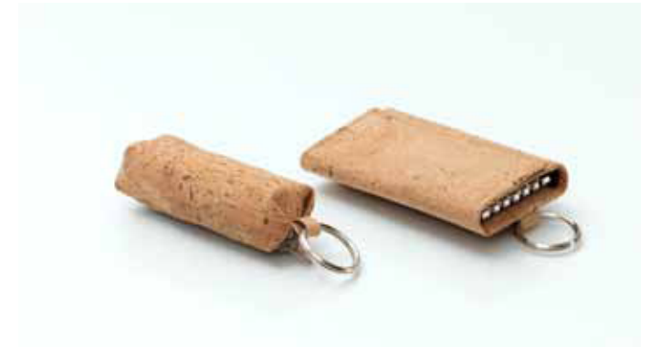
Small Coins Holder B-1415