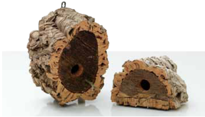
Bird Nest FL-300