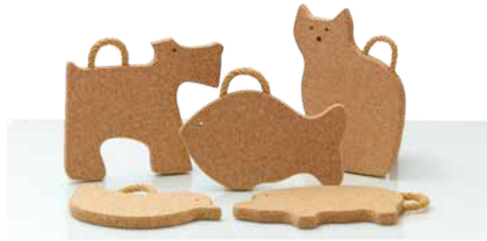
Rope Animal Trivets 1213P