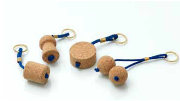
Keychain 9915 9916 1243 1244-2