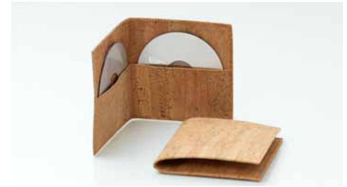
CD Folder 8913