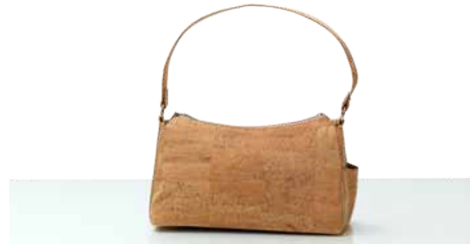
Lady's Bag - Zipper 8892

An ecological sense of style has been built up using eco-friendly products.