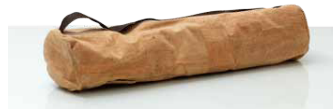
Yoga Mat's Bag 8911