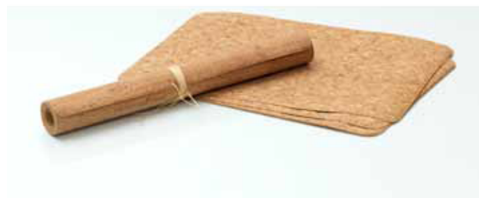
Table Runner SKU 5364310 Table Mat Textile 1210-CT-C