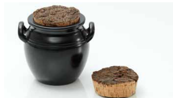
B&B Cork Bungs