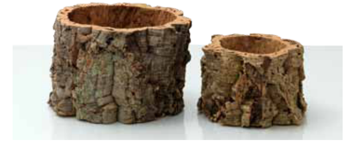
Virgin Flower Pots FL-100 FL-150 FL-200