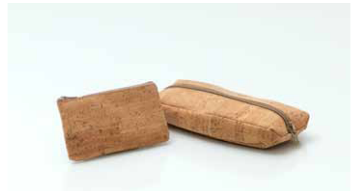
Exchange Purse 8816